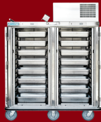
JZHA-144 / JZHH-144 JZHR-144 / JZRR-144

Need larger volume of bulk food transported (up to 24 4" pans)