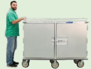
Heavy Duty cart Capacity: 136 & 200