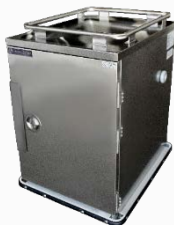
JZA-6UBT-RH Capacity: 52