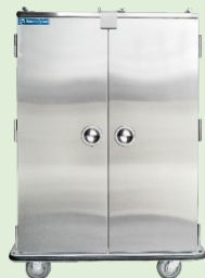
JZA-198 Capacity: 100