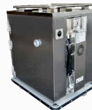
JZH-6UBT-RH Capacity: 52