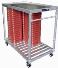
Standard cart Capacity: 102 & 136