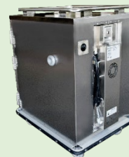
JZH-6UBT-RH Capacity: 60