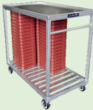
Standard cart Capacity: 102 & 136