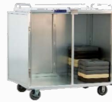
Standard cart Capacity: 126