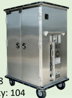
JZH-198 Capacity: 104

You can purchase an ambient insulated cart and snap in a heat box later if you decide you actually need a heated cart