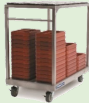
Heavy Duty cart Capacity: 102 & 136