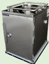
JZA-6UBT-RH Capacity: 60