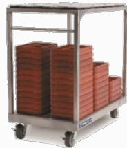
Heavy Duty cart Capacity: 102 & 136