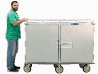
Heavy Duty cart Capacity: 136 & 200