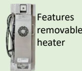
Features removable heater