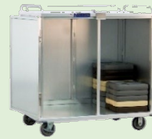
Standard cart Capacity: 126