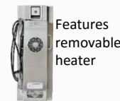
Features removable heater