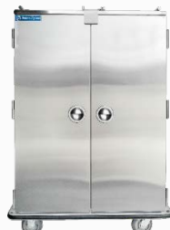
JZA-198 Capacity: 120