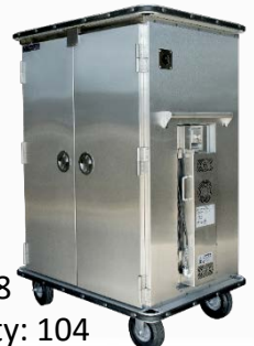
JZH-198 Capacity: 104

You can purchase an ambient insulated cart and snap in a heat box later if you decide you actually need a heated cart