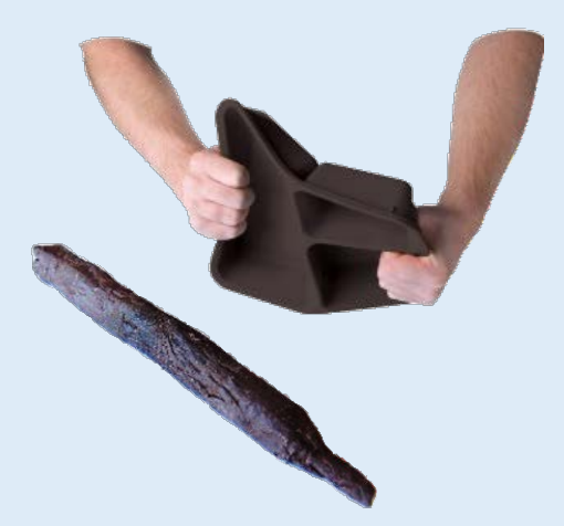
You cannot make a weapon from this material