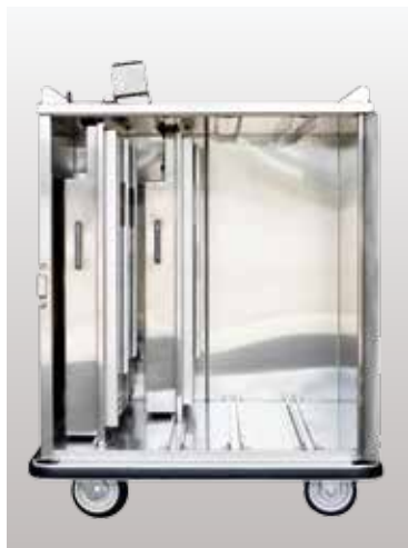
spare heater cabinets holds 8 spare heaters