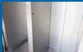
INSULATED CENTER WALL DIVIDER