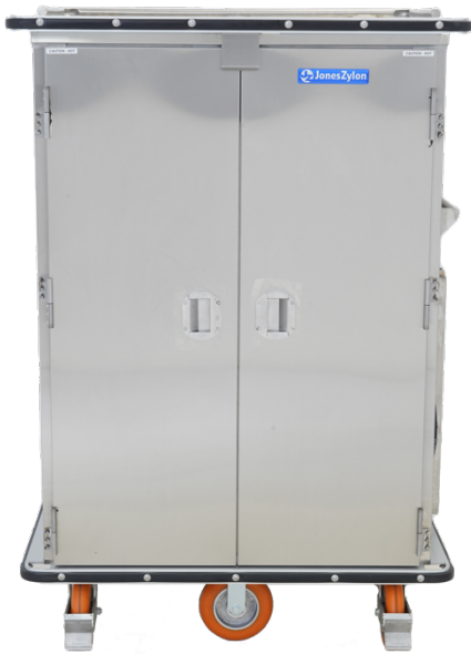
Replace heater for panel for ambient cart