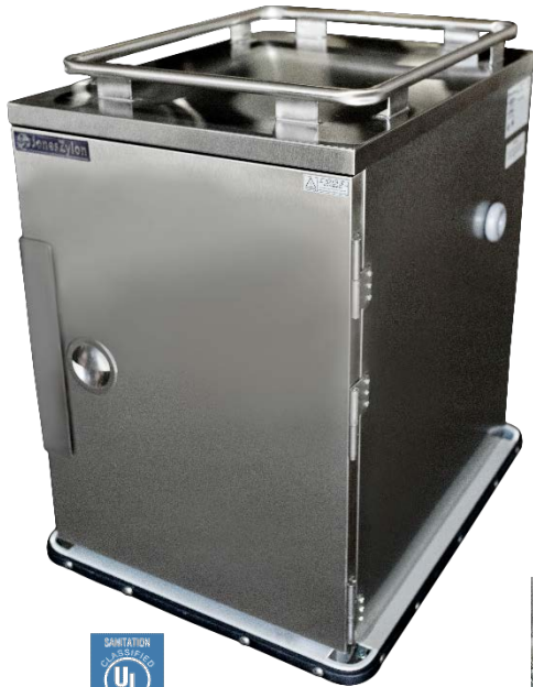
Can replace panel with removable heater