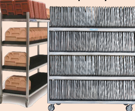
Sheet pan dry rack