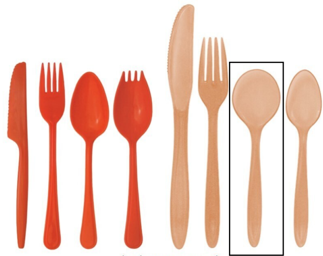
(color may vary)

CASE PACK: 432 or 144 (of one utensil) per case